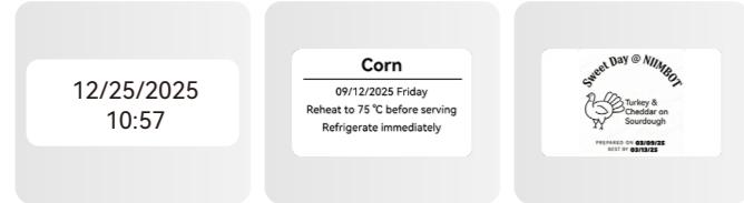
One-button printing of real-time timestamps One-button printing of the most recent history record One-button printing of a specified template